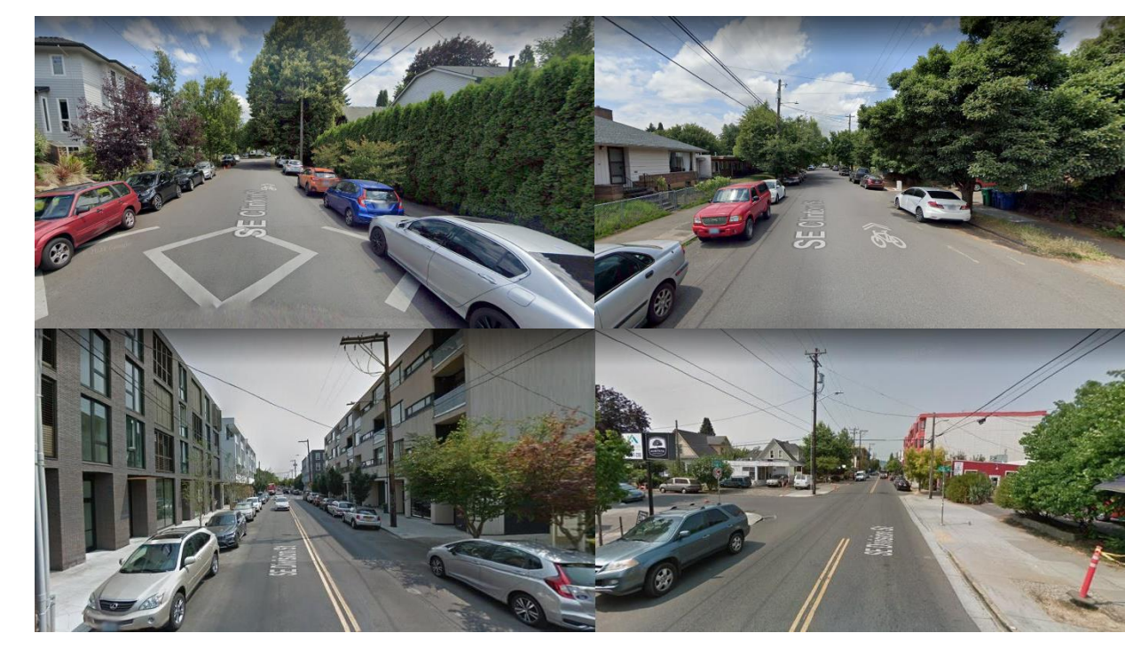
Example of a neighborhood greenway (top) and a nongreenway (bottom)