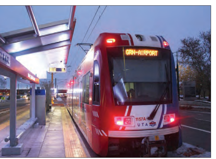
Figure 2: A typical station along the trail.

"I was walking in the middle of the day with my husband and kids we went by a tent. This homeless American older woman came out of the tent and she started to yell at us, she seemed very upset...she was obviously mentally ill. I know she is vulnerable to perhaps other homeless people, men, attacking her, because she is a woman. No one should be homeless, but especially women. I still walk there even if she yelled at me and my husband and children because I enjoy walking in the trail after dinner. But I can see how her presence would deter others from walking by, especially women walking alone or children."