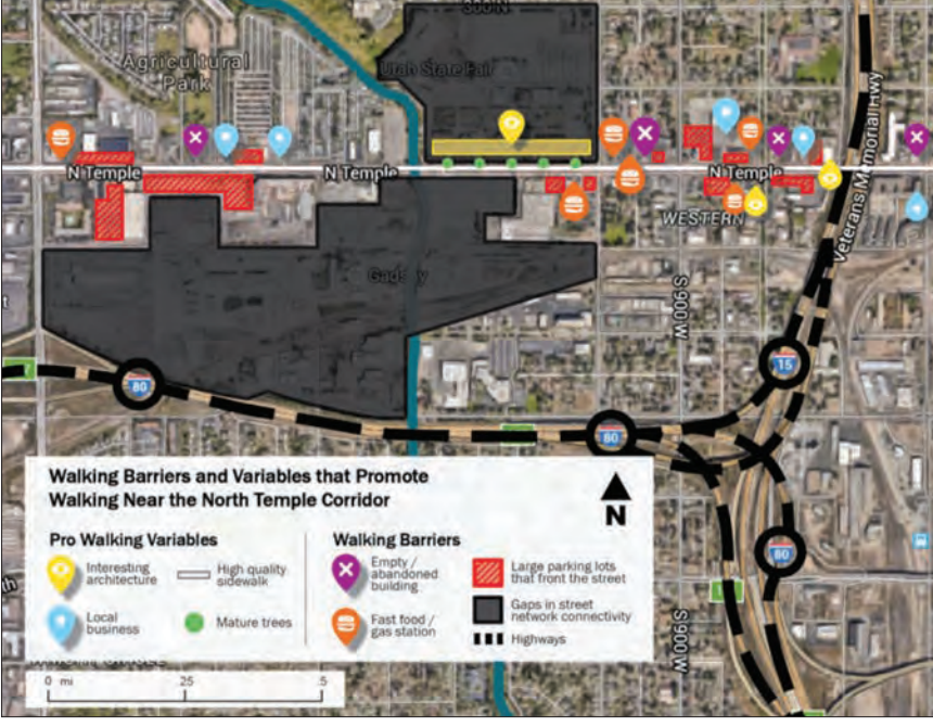
Figure 3: Walking barriers and variables go walking.