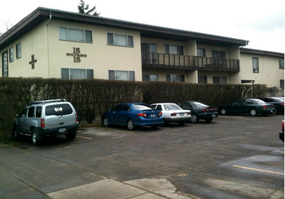
Example of a "Medium sized development"