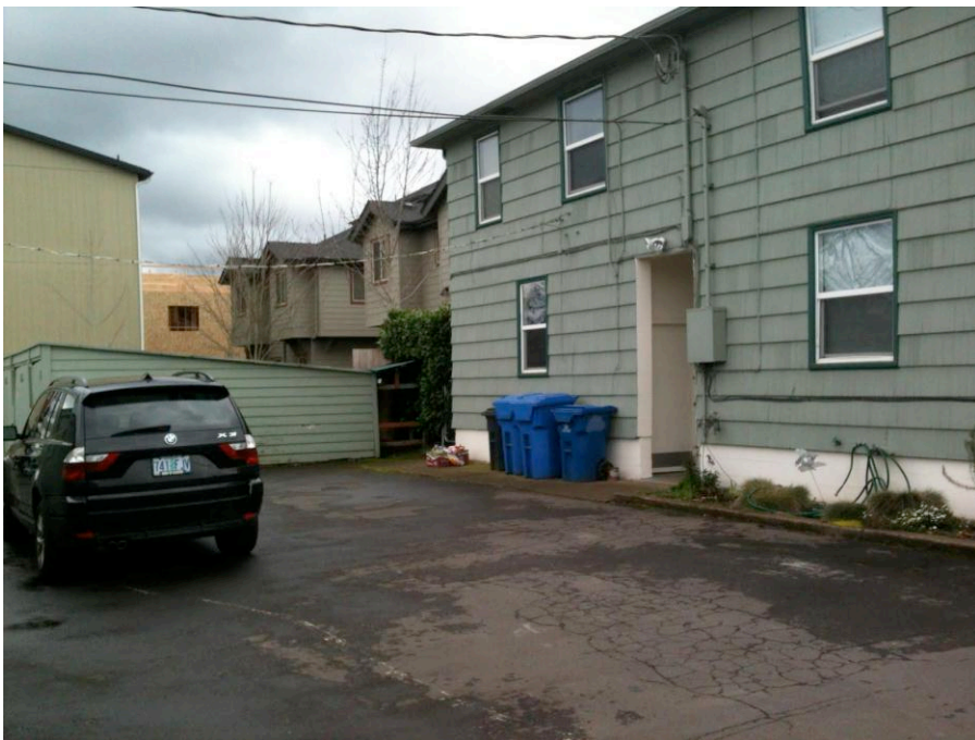
example of a Small development (“Driveway Parking”)