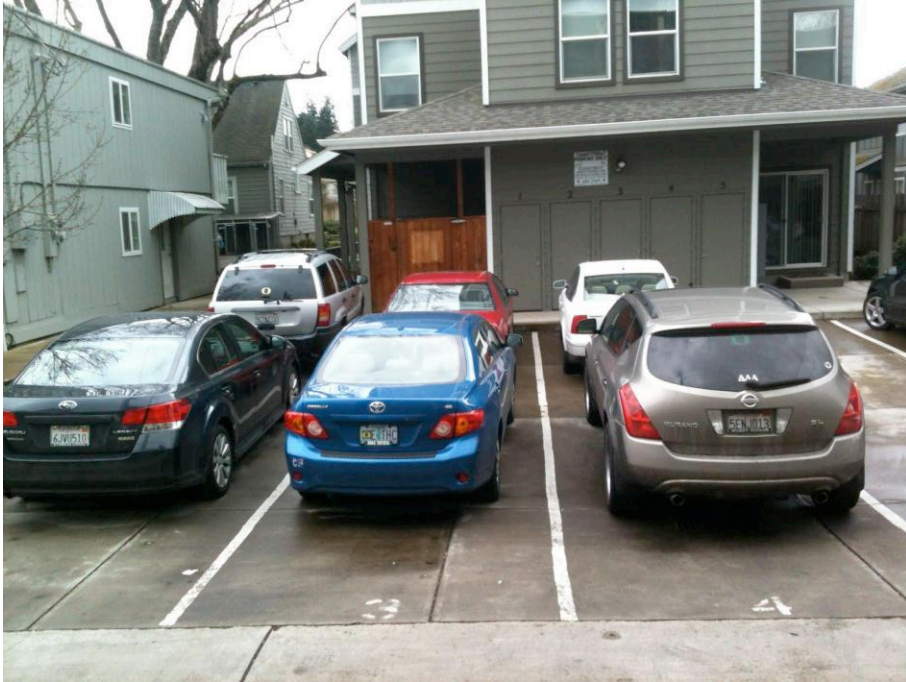
Stacked parking found at “The Calvin”