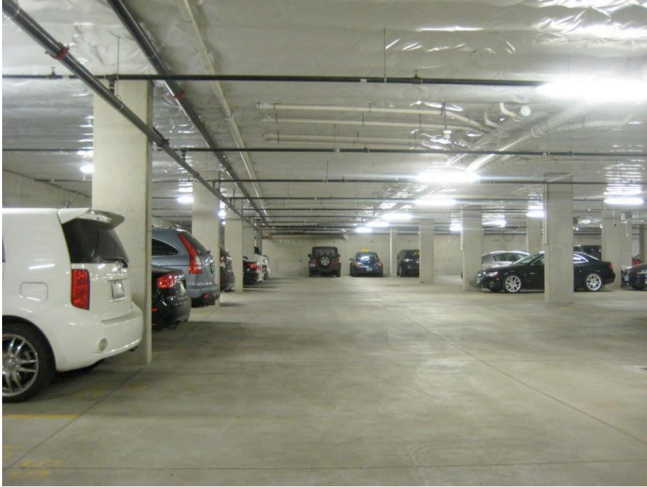
Garage parking at The Pearl