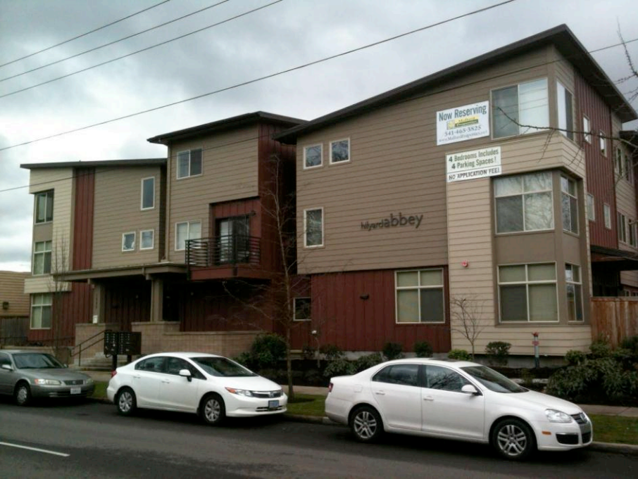
Example of a "Large Development"