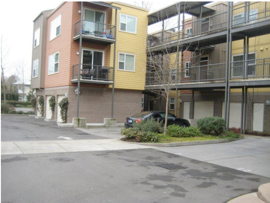
Integrated garages and small driveways at Terraces at the Pavillion