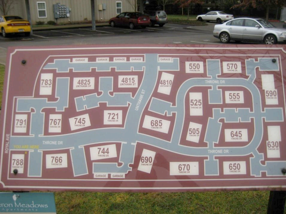
Heron Meadows Building and Parking Overhead