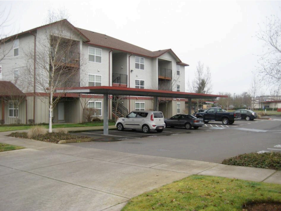
Typical parking area at Heron Meadows