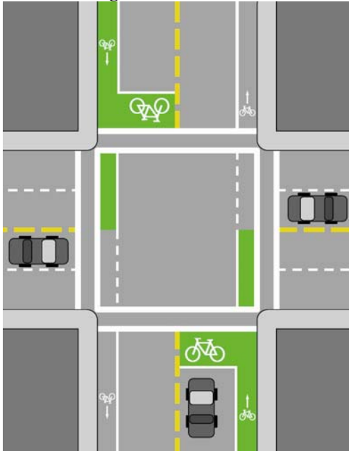
Figure 3: Bike Box Design Treatment in Portland, Oregon

Three studies of advanced stop lines have been conducted in the UK (Wheeler 1995; Wall, Davies et al. 2003; Allen, Bygrave et al. 2005). Allen et al. examined 12 sites receiving the ASL treatment and two control sites in the greater London area, using video to record bicyclist and driver behaviors and level of conflict at the sites. This study did not record behaviors before the design treatments were installed. Wheeler (1995) conducted an earlier study of four advanced stop lines in Bristol, Cambridge and Manchester. This study also used video to record driver and cyclist behavior at the sites, and included a pre-installation study at one site. Wall et al. (2003) used before and after video surveillance and cyclist questionnaires at four sites in Surrey in the U.K. The papers do not indicate if signage was present at the sites to indicate proper usage of the design treatment.