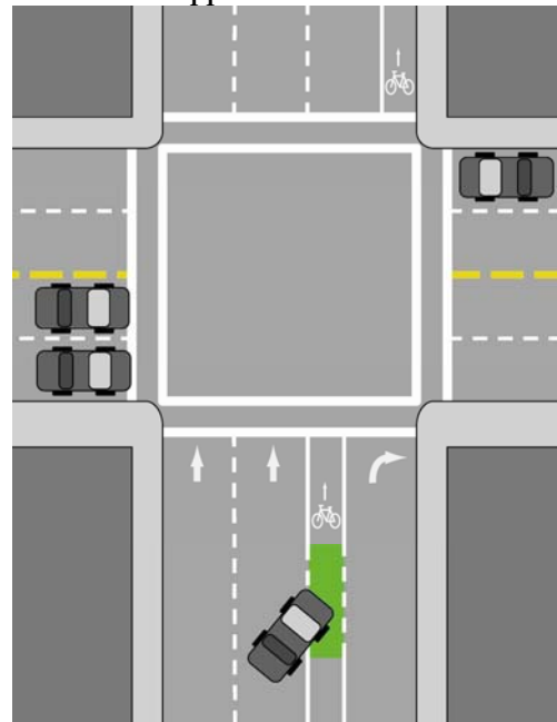
Figure 2: Colored Bicycle Lane Marking at Intersection Approach

Oregon. They concluded that the crossings enhanced cyclist safety by making both motorists and bicyclists aware of the conflict area and found a reduction in conflicts after the lanes were installed. Specifically, they found that significantly more motorists yielded to bicyclists after the pavement markings were installed. However, they also found that cyclists were less likely to use hand signals or turn their head before crossing the lane, potentially indicating a false sense of security provided by the lane markings.